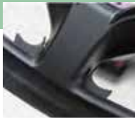
ONE FINGER OPERATION